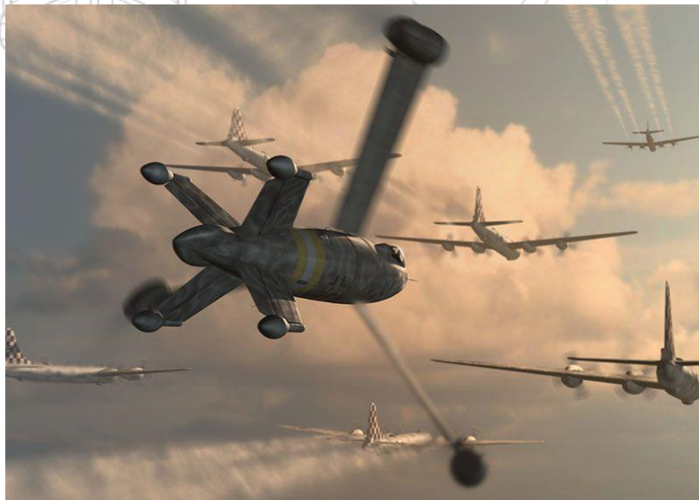
Artwork by David Myhra ( Luft46.com )

Use: Place the Triebflügel in a territory with one or more factories, air bases or naval bases. The Triebflügel acts as an additional AA gun firing one shot at “3” or less.