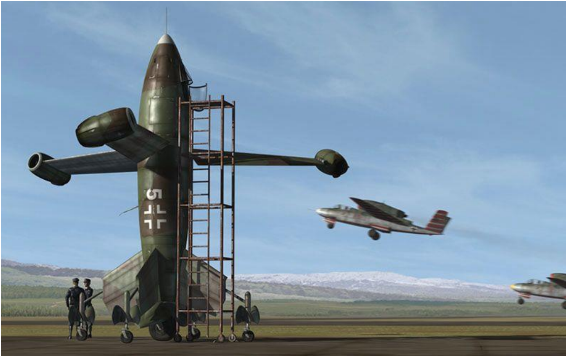
Artwork by David Myhra ( Luft46.com )

The Triebflügel was a point-defense interceptor used for defense of high-value targets such as factories. The aircraft was launched vertically since most industrial complexes did not have their own runways.